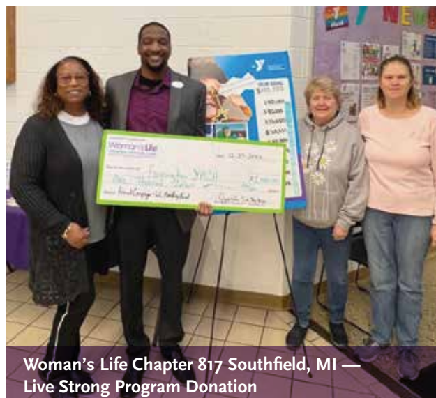
Woman’s Life Chapter 817 Southfield, MI — Live Strong Program Donation

Our mission at Woman’s Life is to prepare women and their families for a secure financial future through the sale of life insurance and annuity products and to support their community outreach. Woman’s Life delivers on this mission through our financial products, and it is ultimately fulfilled with the payment of certificate benefits. In 2022, Woman’s Life is proud to have paid benefits of more than $14.1 million to our members and their beneficiaries.