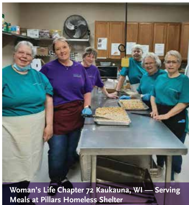
Woman's Life Chapter 72 Kaukauna, WI — Serving Meals at Pillars Homeless Shelter

Woman's Life's financial position remains strong when compared to our peers and other leading life insurance companies. Our surplus represents the amount of assets in excess of liabilities as of the balance sheet date. As of December 31, 2022, Woman's Life reported a total surplus of $13,729,788. That number by itself may not mean much; our position of strength is more clearly demonstrated when using key ratios to compare our financials to the average of 25 of the leading life insurance companies. For example, Woman's Life's solvency ratio, which represents the amount of assets for each $100 of liabilities, as of December 31, 2022, was $107.23. Compare this to the average for those 25 leading companies for 2022