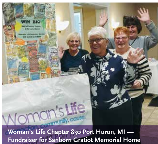
Woman's Life Chapter 830 Port Huron, MI — Fundraiser for Sanborn Gratiot Memorial Home

Woman's Life's surplus increased by $2,238,708, primarily due to the reported net profit and the $2.1 million improvements in the liabilities for employee and retiree health and welfare plans. This is the second consecutive year of surplus growth.