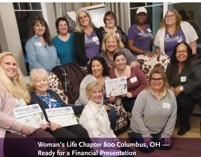
Woman’s Life Chapter 800 Columbus, OH — Ready for a Financial Presentation

Assets grew in 2022 to $203,511,750 and are largely made up of bonds. Woman’s Life reported bonds of $193,839,354 at year-end, which were 95.2% of total assets. Woman’s Life continues its history of maintaining a conservative portfolio, with 98.9% of the bonds rated as investment grade. We maintain these conservative investment practices for the protection of our members. The second largest asset held at year-